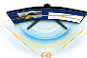
CURVED DESIGN 1500R

Ultra-wide 32:9 monitors with a DQHD 5120x1440 resolution, also called dual QHD, deliver razor-sharp images. They make it possible to divide the workspace into multiple windows and simultaneously open all the documents you need.