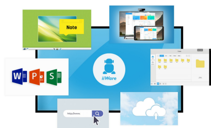
iiWare 8.0 (Android OS)

Share, stream and edit content from any device directly on screen and transform your team meetings or lessons into an easy, fast and seamless interactive session with the included WiFi module ( OWM001 ) and the ScreenSharePro app.