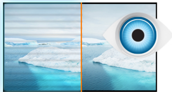
Flicker-free + Blue light

The ProLite B2483HSU is an excellent 24" Full HD LED-backlit monitor with 1920 x 1080p resolution. It features 1ms response time and 80 000 000 : 1 Advanced Contrast Ratio, assuring clear and vibrant picture quality and high contrast. Triple input support ensures compatibility with the latest installed graphics cards and embedded Notebook outputs. The ergonomic stand offers 13 cm height adjustment with pivot, swivel and tilt, making this screen suitable for a wide range of applications and environments where workplace flexibility and ergonomics are key factors. The monitor is TCO and Energy Star certified. A perfect solution for education, local government, business and finance markets.