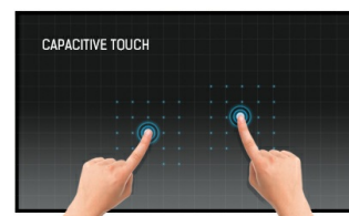
Touch technology - Capacitive

IPS displays are best known for wide viewing angles and natural, highly accurate colours. They are especially suited for colour-critical applications.