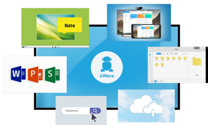
iiWare 8.0 (Android OS)

Share, stream and edit content from any device directly on screen and transform your team meetings or lessons into an easy, fast and seamless interactive session with the included WiFi module ( OWM001 ) and the ScreenSharePro app.