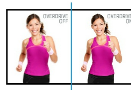
OverDrive ON / OFF

Controlling the monitor's brightness through electric current has allowed us to eliminate the screen flicker. You can easily test it yourself – just look at the screen via you smartphone's camera. Your eyes will love it.