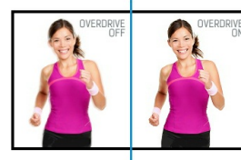
OverDrive ON / OFF

Controlling the monitor's brightness through electric current has allowed us to eliminate the screen flicker. You can easily test it yourself – just look at the screen via you smartphone's camera. Your eyes will love it.