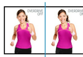
OverDrive ON / OFF

IPS displays are best known for wide viewing angles and natural, highly accurate colours. They are especially suited for colour-critical applications.