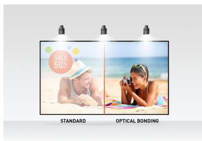
Optical bonded PCAP

Available also in black : ProLite T2752MSC-B1