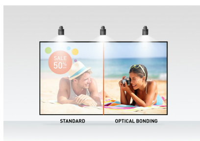
Optical bonded PCAP

The ProLite T2755MSC with its Full HD (1920x1080) resolution and with IPS panel technology offers exceptional colors and wide viewing angles. The Optical Bonded Projective Capacitive (PCAP) 10-point touch technology ensures a seamless and accurate touch response and a lower light reflection, in addition, the display is protected against humidity and potential moisture development. A special Nano coating ensures a smoother touch and less resistance in the swipe. It makes the screen less static and susceptible to dirt, dust and fingerprints. Its flexible stand can be positioned at several angles creating a comfortable and ergonomic user experience. A perfect choice for a vast array of applications.