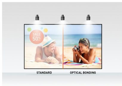
Optical bonded PCAP

The Full HD (1920x1080) Open Frame monitor ProLite TF2238MSC-B1 with IPS panel technology offers exceptional colors and wide viewing angles. The Optical Bonded Projective Capacitive (PCAP) 10-point touch technology ensures a seamless and accurate touch response and a lower light reflection, in addition, the display is protected against humidity and potential moisture development. A robust metal housing and a scratch-resistant 7H edge-to-edge glass with anti-fingerprint coating make the monitor particularly suitable for integration in demanding environments. The monitor meets also a IPX1 protection rating, making it waterproof for a period of time against dripping water. The ProLite TF2238MSC-B1 can be used in landscape, portrait and face-up orientation. A perfect solution for kiosk systems, retail and interactive digital signage installations.