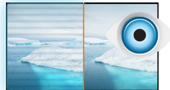
Flicker-free + Blue light

VA panel technology offers higher contrast, darker blacks and much better viewing angles than standard TN technology. The screen will look good no matter what angle you look at it.